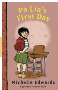
Pa Lia's First Day Harcourt 1999 ISBN 0-15-205748-X