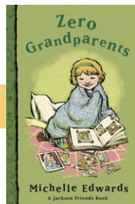
Zero Grandparents Harcourt 2001 ISBN 0-15-205754-4