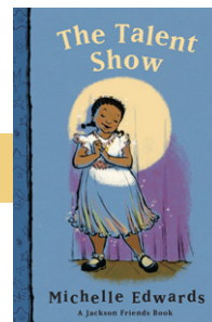
The Talent Show Harcourt 2002 ISBN 0-15-205760-9